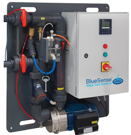
OXAQUA RW CL unit

Maintenance operations are also limited and do not require a specific skillset nor personal protection equipment.